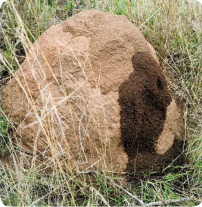
Figure 1 The tens of thousands of ants that live in this ant nest are an example of a large population.

Recall from Section 4.1 that a population is all the members of a particular species found in one area. Biological populations vary in size. They can be large, such as an ant colony (Figure 1), or small, such as a single pair of breeding woodpeckers in a woodlot (Figure 2).